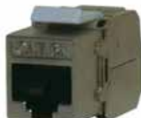
Part No. 800-101 Screened Cat 6A