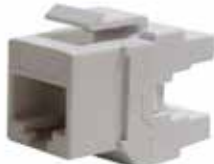
Part No. 006-102 Unscreened Cat 6