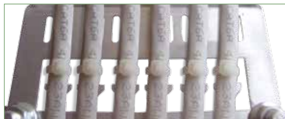
Rear cable management