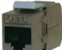
Part No. 800-101 Screened Cat 6A