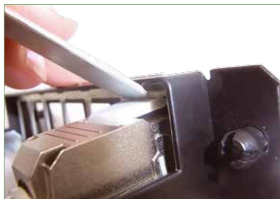
Installation tool for insertion & removal of keystone jacks