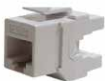
Part No. 005-102 Unscreened Cat 5E