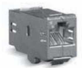
Side 1 RJ45- feed-trough coupling straight MS fitting