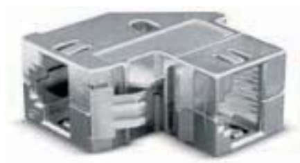
Side 1 RJ45- feed-trough coupling angled MS fitting