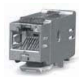
Side 2 RJ45- feed-trough coupling angled Keystone fitting