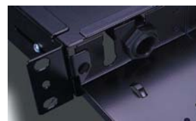
Cable entry 4 x 10mm gland holes 2 x 20mm gland holes