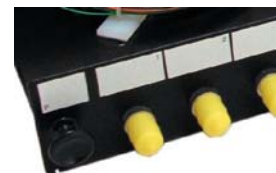
Easy panel identification labelling