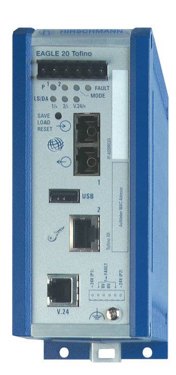
EAGLE20 Tofino Security Appliance

Tofino is designed from the ground up with a rugged environment, staff skills and needs of industry in mind, and it protects better and is easier to install than IT firewalls and other security products.