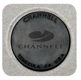
Customized Logo Puck