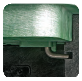
"L" Bolt Security Latch