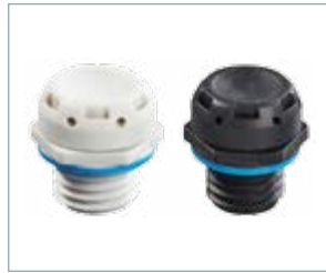
EVPS 12 HF