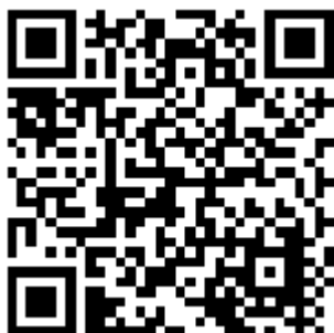
SCAN QR FOR PRODUCT PAGE

** E2000 supplied as RdM E2000 connectors. Not available in combination with MTRJ or MU.